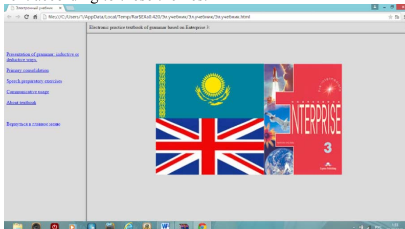
Picture 2. The menu of an electronic practice textbook.

Each of modules of Enterprise 3 has definite theme and we decided to add regional component according to these themes.